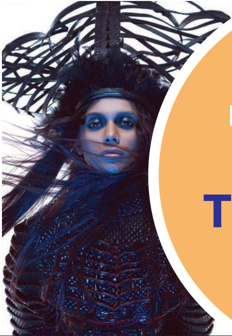
High end Fashion