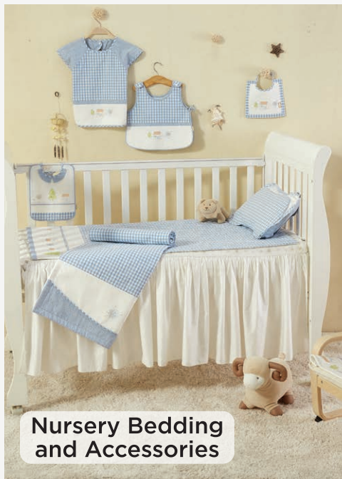
Nursery Bedding and Accessories