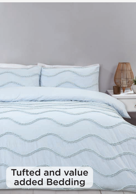
Tufted and value added Bedding