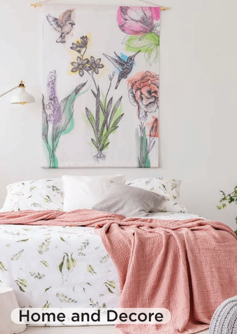
Home and Decore