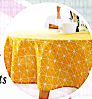
Table Cloths, Napkins, Placements and Table runners etc.